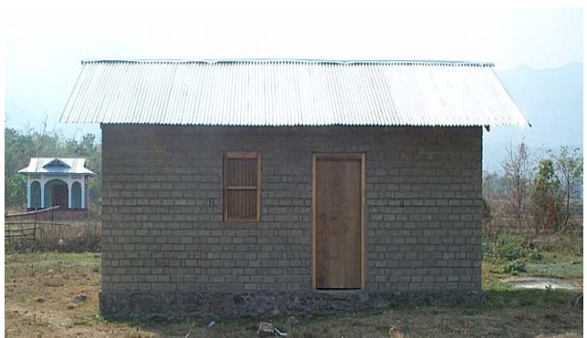
Stabilised Mud Block House for HYS Club