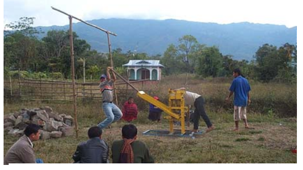
Operational of the machine

in construction for walling, roofing, arched openings, corbels etc. The blocks are manufactured by compacting raw earth mixed with stabilised such as cement or lime under a pressure of 20-40 kg/cm<sup>2</sup> using a manual or mechanised soil press. TARA-Balram