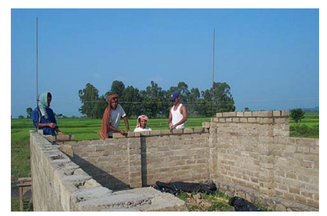
Construction Stage of Mud Block House