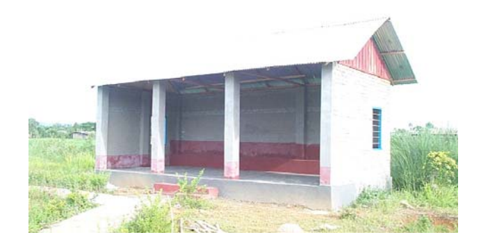
Stabilised Mud Block House at Manipur Science Centre, Imphal