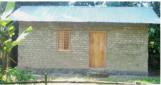
Stabilised Mud Block House for DEWALI, Club