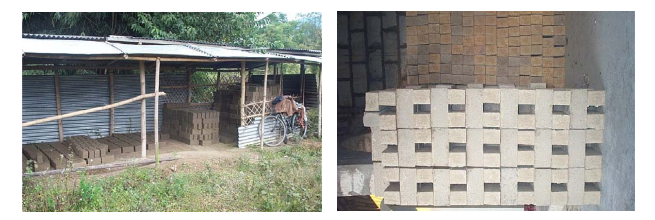
Stabilised Mud Blocks

In India the technology for stabilised earth block is being promoted by HUDCO's network of Building Centres to build public sector housing and institutional projects.