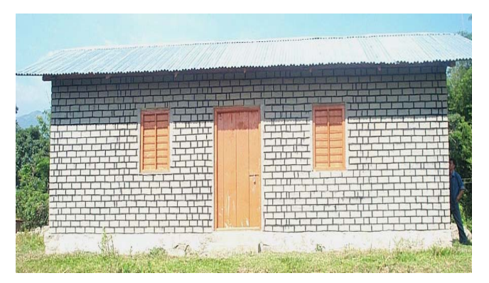
Stabilised Mud Block House for KYDC Club