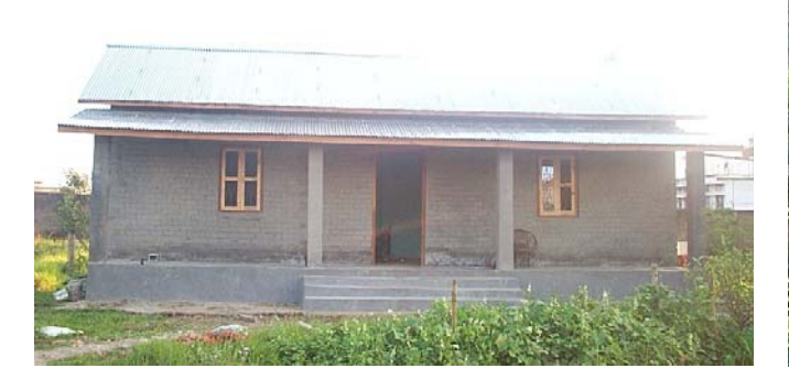
Demo Mud Block House at MASTEC Office Complex