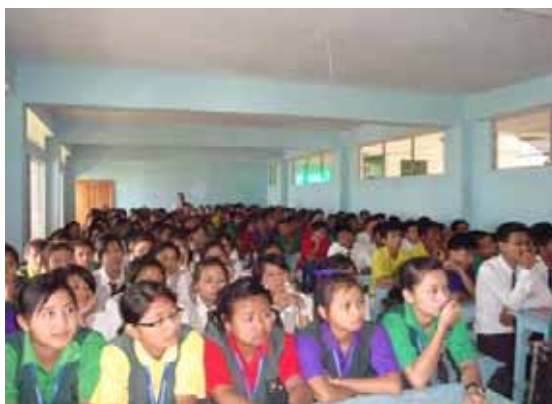
Students attending the Lecture Programme at Standard Robert School, Canchipur

conducted for the participating students. The lecture programme received good response from the participating schools and colleges.