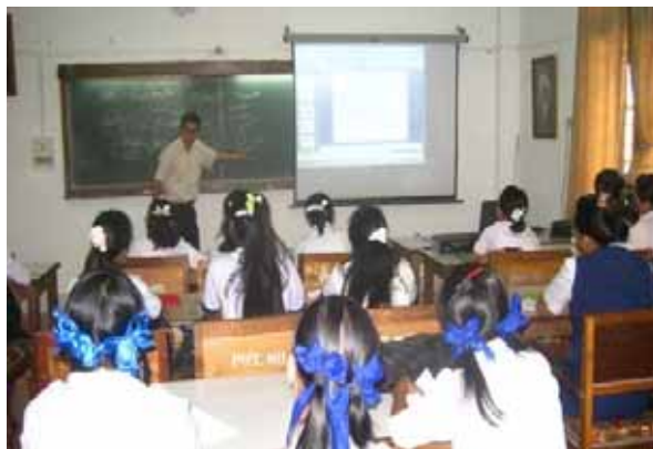
Interaction in Physics Deptt, Manipur University

The participants visited Physics laboratories of Manipur University. The Professor and Head of Physics Department, Manipur University took the participants to the sophisticated laboratories including XRD, XRF, electronics labs. etc. of the department and also highlighted about the research activities carried out in the physics