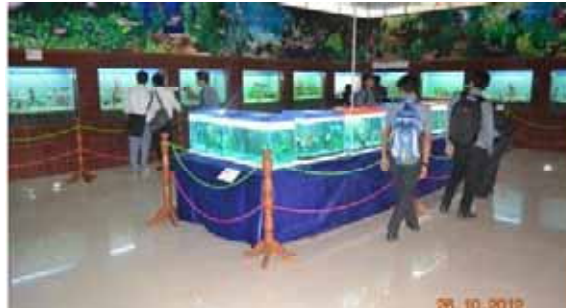
Aquarium tanks of Manipur Science Aquarium

Local and other aquarium fishes were kept in the tanks for viewers. These local fishes are collected from different parts of the valley as well as hill areas of the state. Interested visitors also donate fishes to the aquarium. Local fishes such as Pengba, Meitei Ngamu, Ngamu Bogra, Ngashang, Nylon-nga, Lanmeithanbi, Muka-nga, Phabou-nga, Ngakha Meingangbi, Nga-tunghanbi, Ngaton,