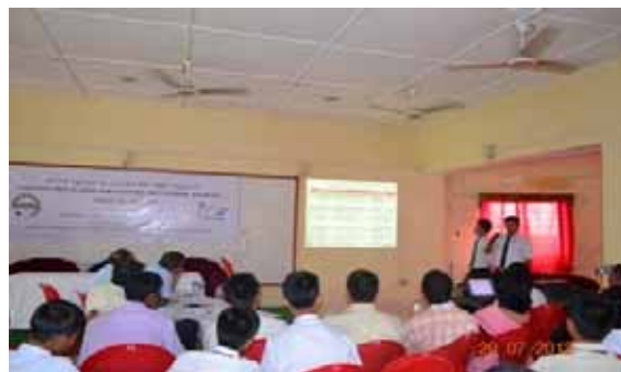
Students' science elocution in progress