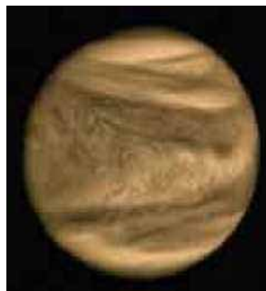
The Planet - Venus

Venus, the second planet from the Sun, is often called the Earth's sister planet because of its close similarity in diameter, mass, density and probably also in composition and internal structure. It is the brightest planet of the Solar System due to the thick cloud in the atmosphere reflecting 75% of the sunlight. Because of the phenomenon known as the Green House Effect with thick CO 2 (98%) in the atmosphere on Venus, its average surface temperature is about 480 0 C due to which it is called the hottest planet of the Solar System. Venus orbits at an average distance of 108.2 million km from the Sun and completes one revolution in 225 earth days at an inclined angle of 3.4 0 to the plane of Earth's orbit. Venus rotates backward compared to the Earth and much more slowly completing one rotation in 243 earth days. In the ancient Greek mythology, Venus is known as the Goddess of Love, Peace and Beauty. When Venus comes between the Sun and Earth, it is known as Transit of Venus. The event occurred recently on June 6, 2012.