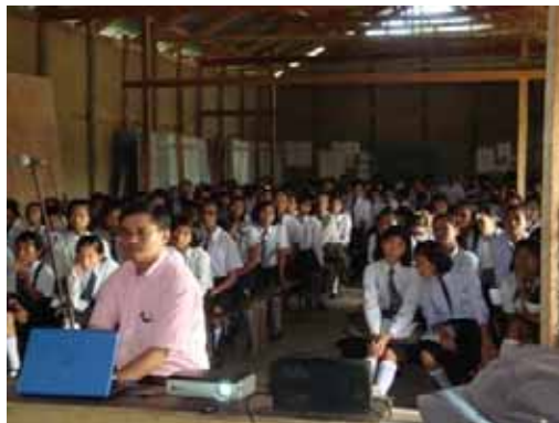
Lecture Programme on sanitation at Mothers Pride Academy, Bishnupur

About 1200 students of the state had been benefited out of the lecture programme. In fact, the programme received good response from the participants. Most of the participants / people felt about the importance of the lecture programmes in maintaining good health through proper sanitation practices. Feedbacks in the form of questionnaires were obtained from the participants. Authorities of schools suggested for organizing such programme in the state in the future for the benefit of the people.