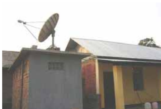
Satellite Interactive terminal - Edusat

Vigyan Prasar, an autonomous organisation of Department of Science & Technology, Government of India, New Delhi in association with Development and Educational Communication Unit (DECU) of Indian Space Research Organisation (ISRO) established some Satellite Interactive Terminals (SITs) in the country. SIT is a two