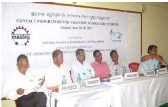
Face to Face: Scientists answering to the student's questions