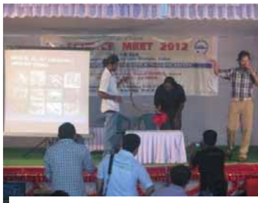
A session of Lecture-cum-demonstration of Science Meet 2012