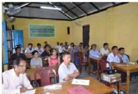
EduSat programme going on

The main target groups for the SIT programme included representatives of science clubs, teachers, school students & children (college students and higher/technical/university students), interested general public etc. Programmes such as quiz, trainings, lectures etc. were being conducted on various topics from time to time round the year and students, teachers, science activists etc. were benefited from the programme.