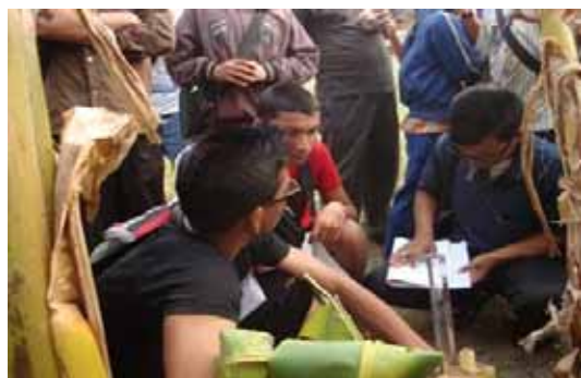
Student participants measuring growth rate of plants