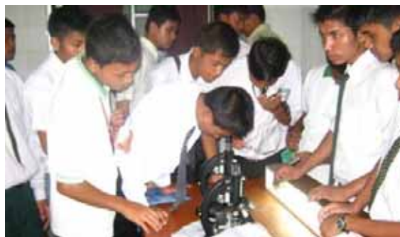
Students studying blood cells using microscope