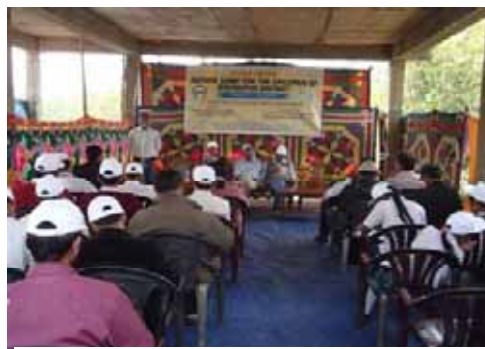
Inaugural function - Nature camp