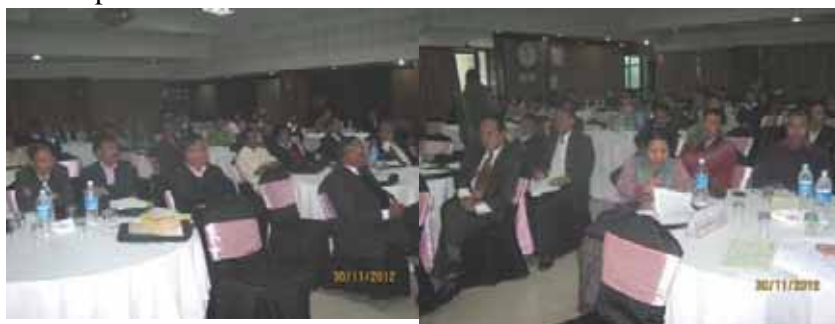
A Section of the delegates attending the Brain Storming – Challenges in Water related issues