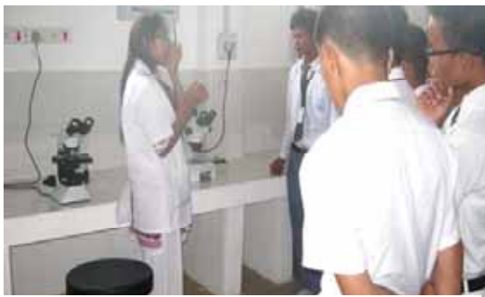
One women faculty interacting with students in the lab. of Orchid Gene Conservation