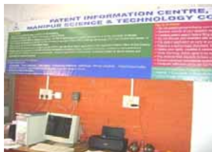
PIC Manipur unit

The PIC, Manipur is well equipped for providing services on IPR related issues in the State. The Centre works on creating awareness about Intellectual Property Rights (IPR), especially patents and Geographic Indications (GI), in the state of Manipur and provide patent searches to the interested parties in the universities, industry, government departments and R&D institutions.. Further, it guides the inventors in respect of patenting their inventions. The project team of the PIC interacted with several entrepreneurs and innovators in the state