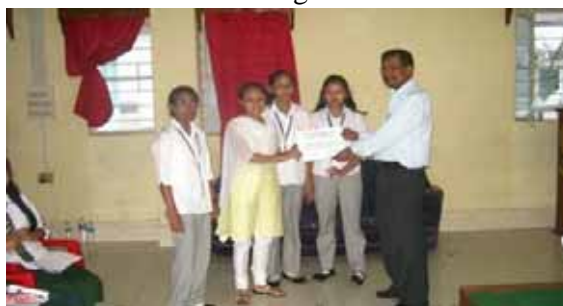
Distribution of certificates to the participants