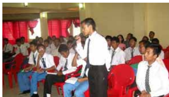
Students asking questions to the scientists during Face to face with distinguished scientists