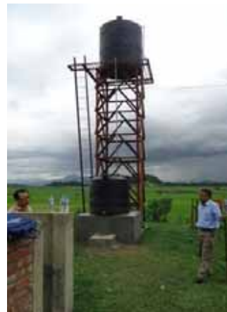
Safe drinking Water unit installed at Khabam

Community Pond based Safe drinking Water system using ultra-filtration technology developed by Bhabha Atomic Research Centre (BARC), Mumbai was successfully installed at Khabam Bamdiar village, Imphal west and started providing drinking water to the villagers and the installation of one more unit at Athokpam village, Thoubal District. is in progress.