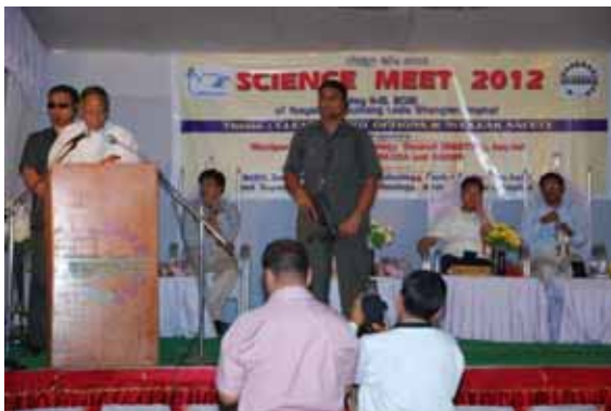
Chief Minister (Chief Guest) addressing on the valedictory function