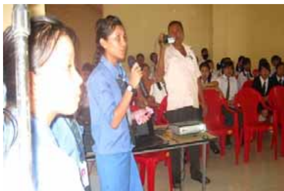
Science Elocution in progress

The students had a science elocution in which each team comprising of two or three students made presentations on a science topic of their choice for a duration of six minutes each on the 5 th day of the programme. The students team of Mannu English School and Mother’s Pride Academy made presentations on the same topic “Vitamins”. The students team of Phungyar Hr. Sec. School and Paree Imon Sindam Sang presented on the topics “One