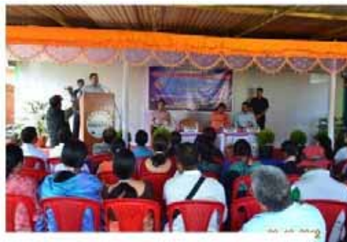
Inauguration of State level Aquarium Exhibition-cum- Flower Show

The Council, in association with Fish World, Keisampat Keisam Leikai, Sharma Aquarium, Keisampat Jn., International Plant Growers' Association (IPGA), Uripok Sorbon Thingel, Cinderella Plant's Care, Chmgamakhong Singjamei Chinga Keithel, King City Evergreen Nursery, Pisumthong Bazar and Gaminash Nursery, Bamon Leikai Brahmapur Nahabam Imphal East organized the 1st state level Aquarium Exhibition-cum- Flower Show during October 26 - November 6, 2012 at the Aquarium complex. Altogether 84 species comprising of 28-Indigeneous; 56-exotic in 68 tanks and 124 flower plant species were displayed during the exhibition. About 500 visitors per day including students and children visited the exhibition.