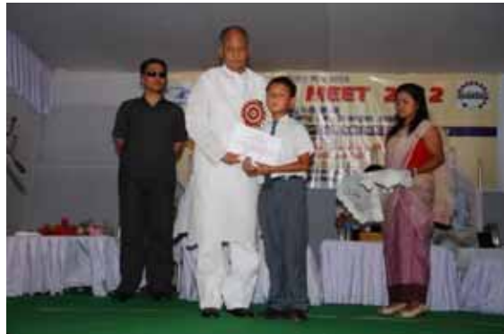
Chief Minister distributing prizes to the students