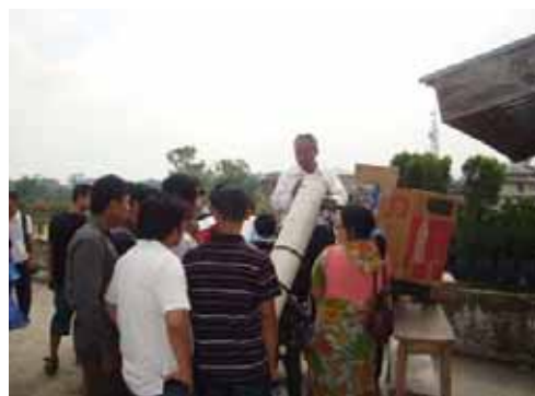
Telescope installed to witness Transit of Venus on June 6, 2012

batch by batch to see the rare event. All visitors were happy to see the Venus moving as a black dot on the disk of the Sun for about 10 minutes and during which Resource Persons were explaining and discussing the queries from the viewers. The sky was not very clear