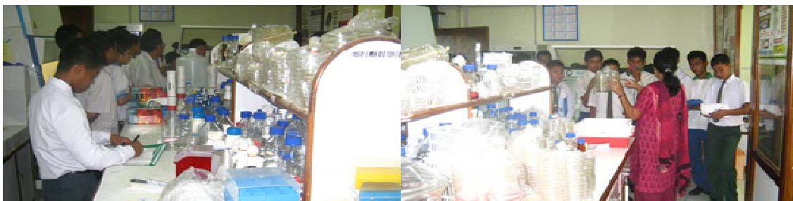
Participants visiting IBSD laboratory, DBT, Imphal and interacting with researchers