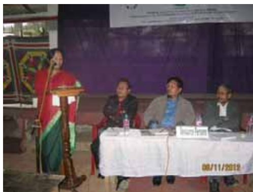
Script presentation by participants and evaluation by experts in progress