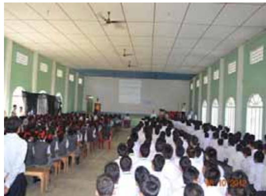
Lecture Programme at Evergreen Flowers School, Thoubal Ningombam

Under the initiative of National Council for Science and Technology Communication, Department of Science and Technology, Government of India, every year the month October is celebrated as Science for Sanitation Month all over the country with variety of activities addressing to issues on health and sanitation. Manipur Science and Technology Council celebrated Science for Sanitation Month by organizing Lecture cum demonstration programmes addressing to various issues of Health and Sanitation