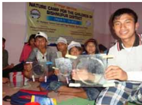
Participants preparing mini aquarium