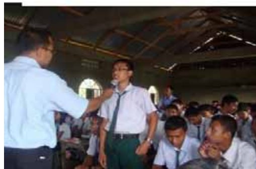
A student interacting with the experts by asking question on water

2,000 students / people had been benefited out of this campaign. During each interaction session, participants put interesting questions related to water treatment, management and conservation and resource persons gave answers.