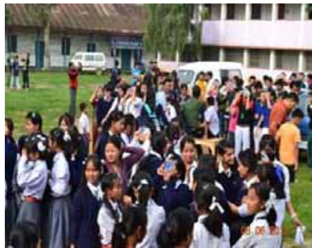
People witnessing Venus transit on June ,using solar viewer

Viewers since improper use of the Solar viewer or looking at the Sun continuously even with the Solar viewer was harmful to the eyes.