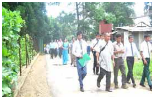
Participants on walk to the farm science centre in the KVK campus, Hengbung,