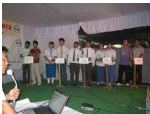
Student's Science Quiz Competition