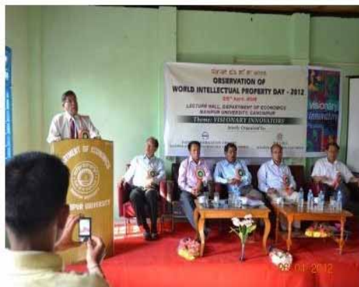
Vice Chancellor of Manipur University sharing his views on IPR