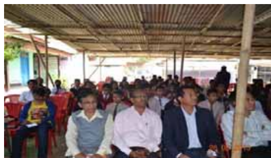
A section of Audience in the Observation of National Science Day 2013