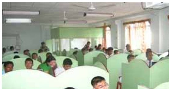
Students' practical in computer applications - Creation of E-mail accounts in progress

them learn some aspects of IT. During the session at DOEAAC center, all the student participants could open e-mail accounts of their own and start communicating among themselves. The Scientific staff also monitored the performance and enthusiasm of the student participants while conducting the practical in the center. Apart from learning E-mail related issues by use of computers, the students also interacted with the scientific faculties of the centre on scopes of IT. On the second day, the participants were taken to the Centre for