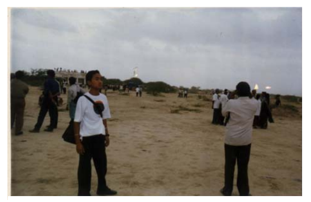
A Student sponsored by MASTEC at Bhuj, (Gujarat) viewing TSE 99

news papers etc.) on various themes of topical importance for print and electronic media. The registered participants on the last day of the four day training programme, decided to form