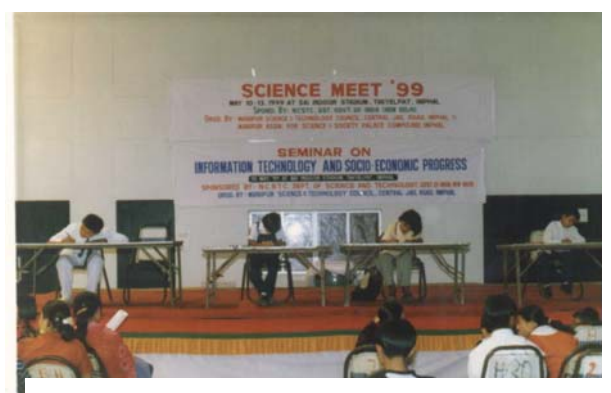
Competitors at work during SM-99

3. Science Meet 99 in connection with National Science Day was organised by Manipur Science and Technology Council (MASTEC) in association with the Manipur Association for Science and Society(MASS), a local science body, at the Sports Authority of India Complex , Takyelpat, Imphal during