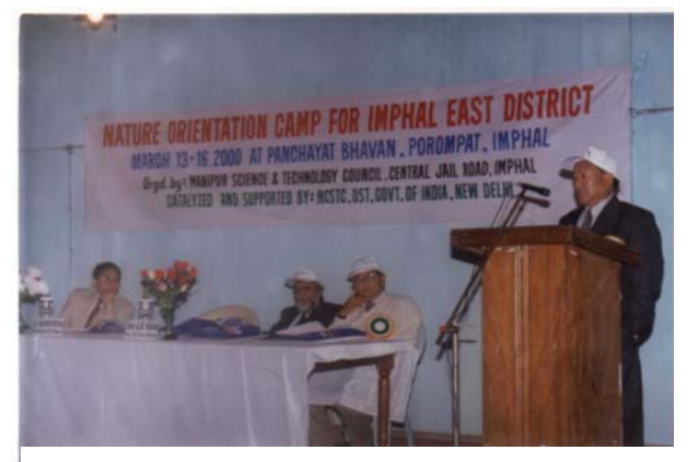
Dr. Khashim Ruivah, Minister (S&T) inaugurating the nature camp

8. Nature Orientation Camp for the children of the Imphal East District was organised during March 13-16, 2000 at Porompat, Imphal. Seventy participants representing sixty students and ten teachers from ten schools participated in the programme. The activities