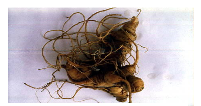
Panax pseudo-ginseng found in Manipur

uprooting by the ignorant tribal folks through introduction of scientific farming in a lab-to-land practice. Micropropagation of ginseng through tissue culture and intercropping with another medicinal Thalictrum will be involved. The project involves distribution of Ginseng seedlings to groups of tribal