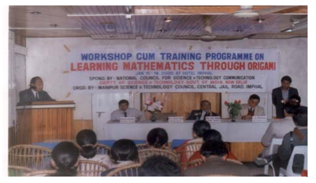
Inaugural Session of origami workshop

7. A state level Training workshop on learning mathematics through origami was held during January 15-18, 2000 at Hotel Imphal. Thirty five participants were present in the training. Two resource