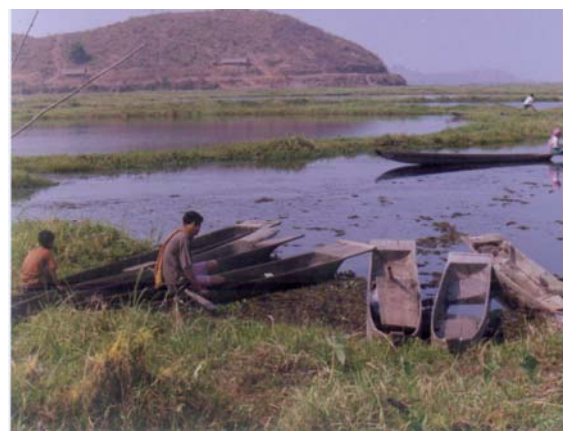
Dug out canoes used in capture fishery in Manipur

wetlands. The biggest freshwater lake of India, the Loktak Lake (289 sq. km.) is situated in Manipur Valley along with numerous other wetlands covering an area of about 550 sq. Km. ture fishery in the hill streams is practiced through many harmful devices like poison and explosives. Both Culture and Capture Fishery in the Valley of Manipur are very active. However, the Capture Fishery in Manipur still remains a subsistence occupation due to unscientific methods. When there is a potential of landing 60,000 tonnes of fish in a year, the present landing is 15,000 tonnes against the demand of the state figuring above 22,000 tonnes.