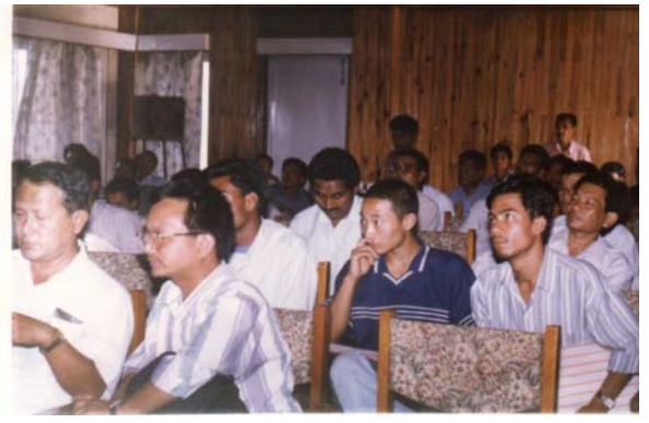
A section of the sensitisation workshop